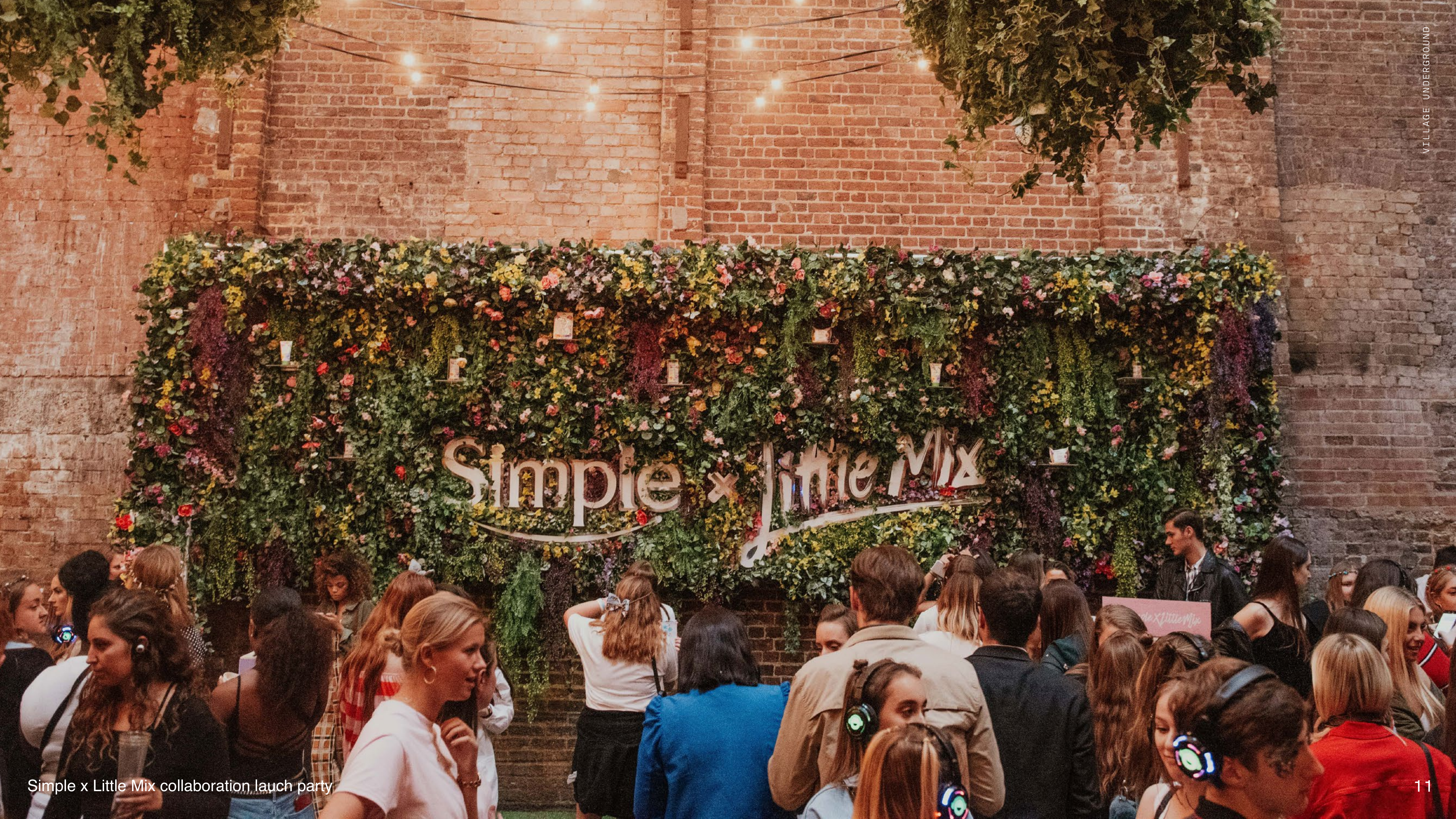
Simple x Little Mix collaboration launch party